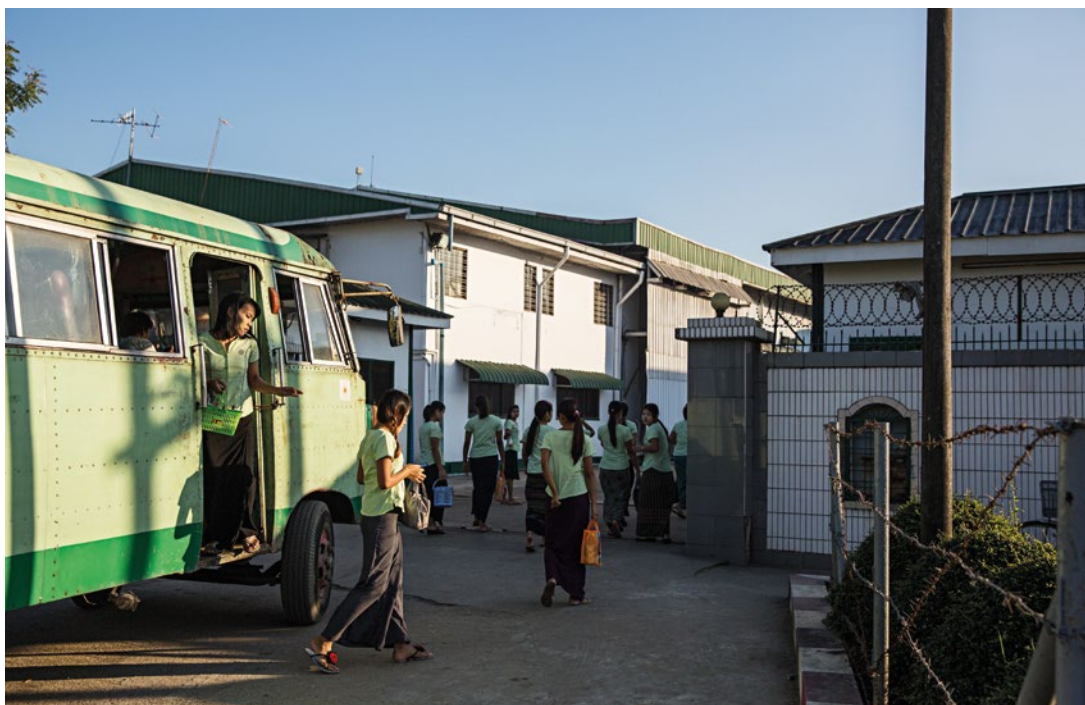
A shuttle bus drops off workers.. Lauren DeCicca | MAKMENDE