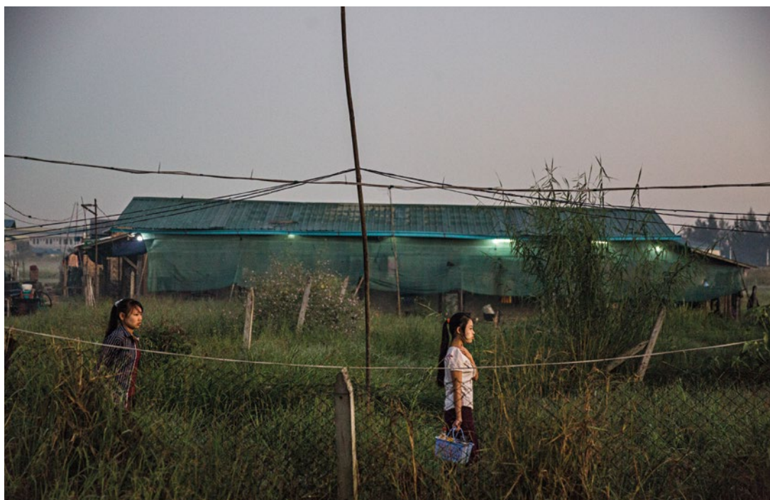
Garment factory workers walk down the footpath near their home on their way to work. Lauren DeCicca