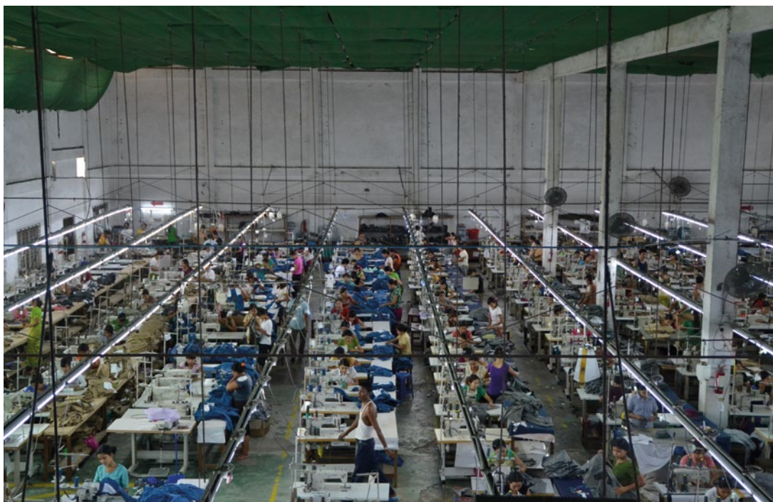
A garment factory in Myanmar (this factory was not included in the research).

and dispute settlement and the presence of labour unions and CSOs, the SEZs have special rules. Human rights and labour rights are not necessarily well served in these zones.