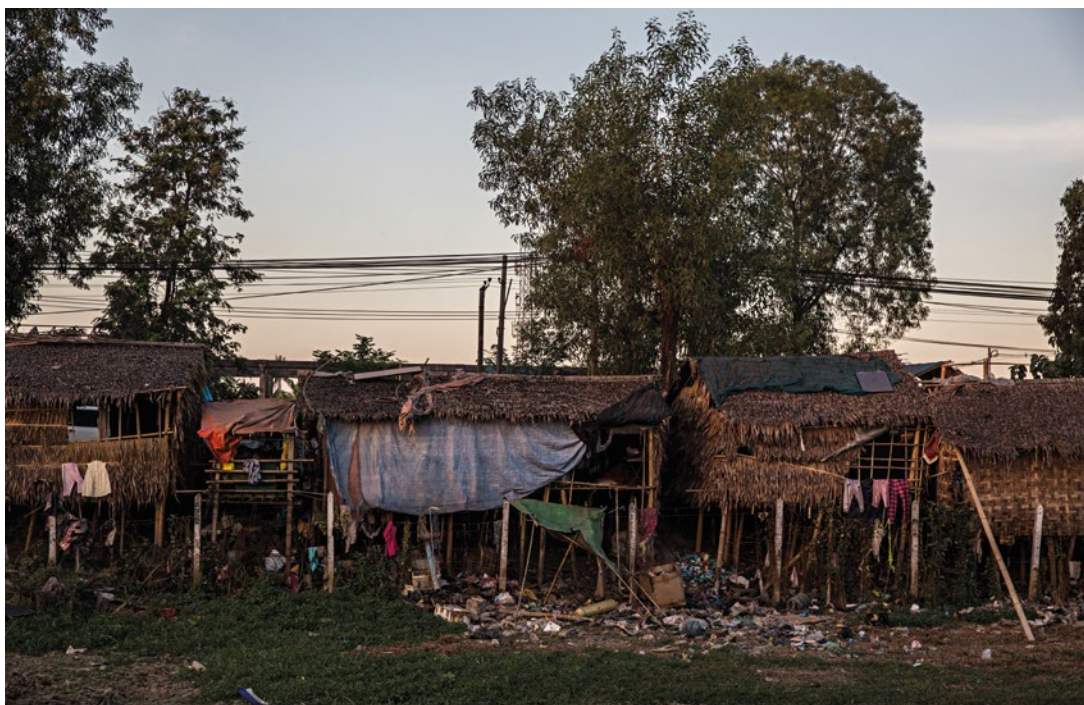
Squatter area for garment factory workers.

include risks related to land grabbing, questionable ownership and military influence, the powerful presence of foreign-owned garment factories, child labour and the position of ethnic workers.