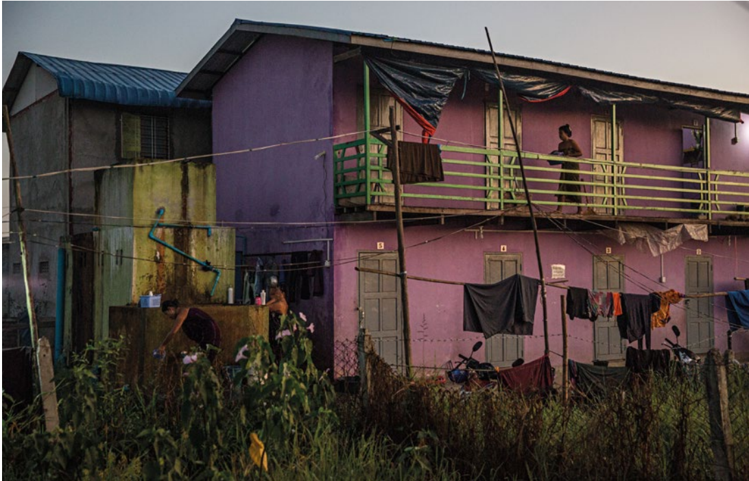
Exterior of a dormitory for garment factory workers.

understanding that the Myanmar labour movement and civil society is in full development; unions and labour NGOs are being established as we speak.