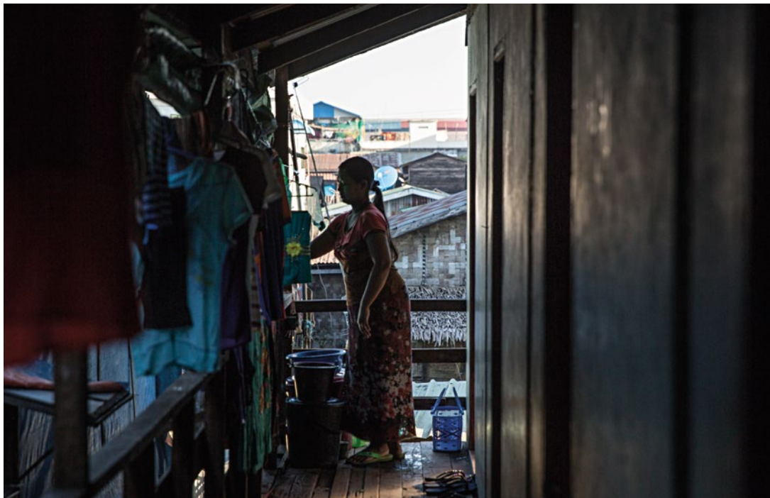
A garment factory worker hangs clothes out to dry at her dormitory in Yangon, Myanmar.

In May 2010, FWF adopted a formal position on Myanmar. At that time FWF was of the opinion that the situation in Myanmar was such that there was insufficient foundation for a credible process that could lead to improvements in working conditions in factories and that there was no credible structure for strengthening social dialogue between local stakeholders. Consequently, FWF required members and prospective members to phase out production at factories in Myanmar. 241