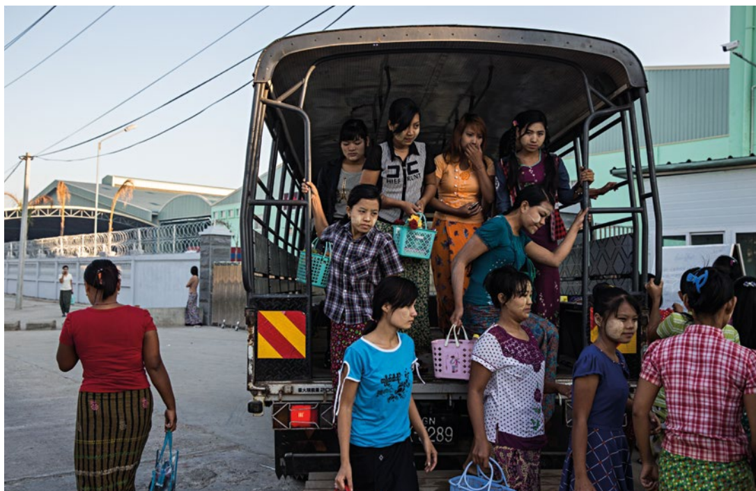
Garment factory workers get dropped off by a shuttle bus service in the morning before work.

The following buying companies did not respond to the review request: Lonsdale, Kawasaki, Hudy, Sports Direct, Erima, Henri Lloyd, Karrimor, Pierre Cardin, Arrow, Bessshirt, Izumifuhaku, K2, and LL & S Purchasing Corp. (The Levy Group).