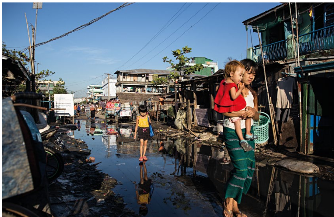
A woman and children walk down the flooded streets of Yangon's Hlaing Tharyar industrial Zone, an area that houses many garment factory workers.

Moreover, the current administration relies heavily on civil servants who served under the previous government – including, for example, the Director General and the Secretary of the Ministry of Labour. District and township level dispute handling bodies are also still run by civil servants who have been in post since the days of the military regime.