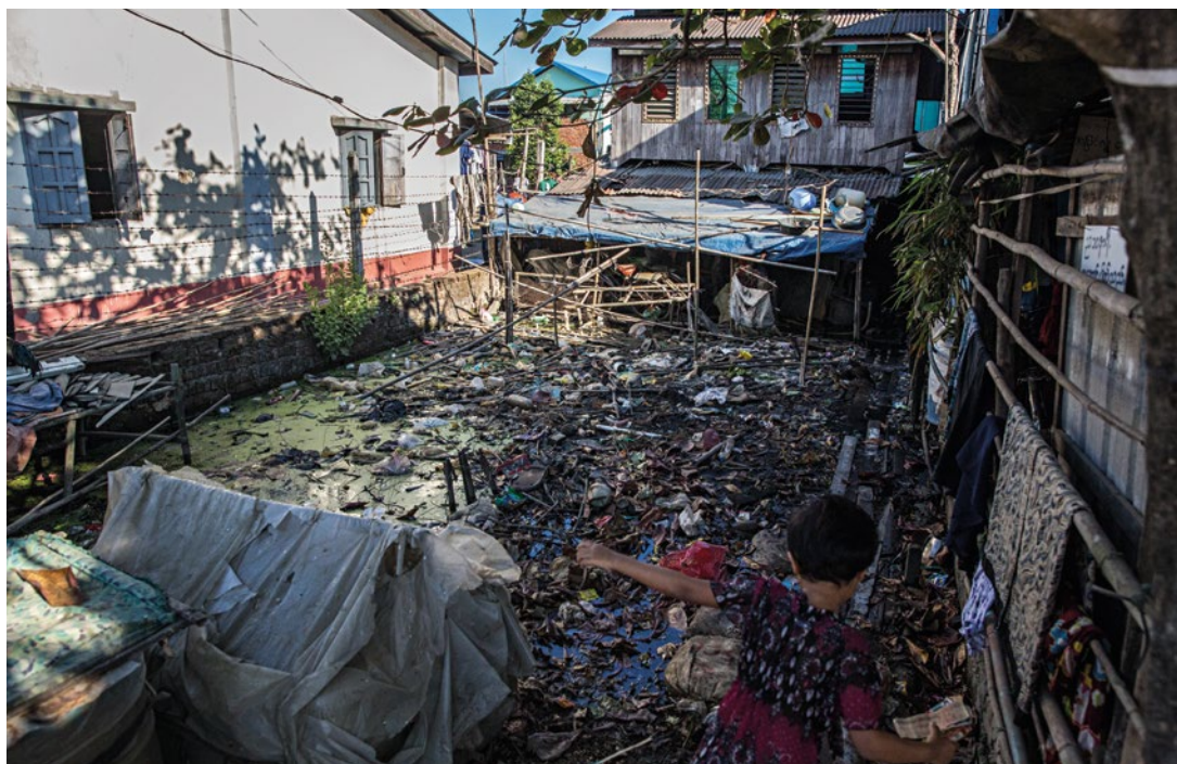
A young girl walks into her home, where many garment factory workers live. The area is full of trash and is flooded with dirty water.

and human rights risks, unless expressly stated. 60 The SIA final report expected the textile sector “to derive net positive gains from an EU-Myanmar IPA in all sustainability issue-areas.” 61