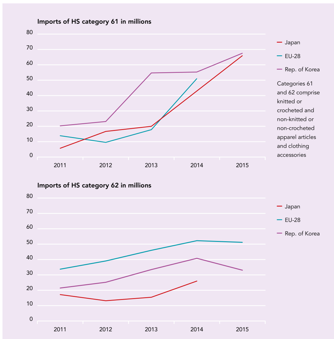
Figure 1 Imports of HS category 61 and 62 from Myanmar

Source: UN Comtrade Database https://comtrade.un.org/data/ 133