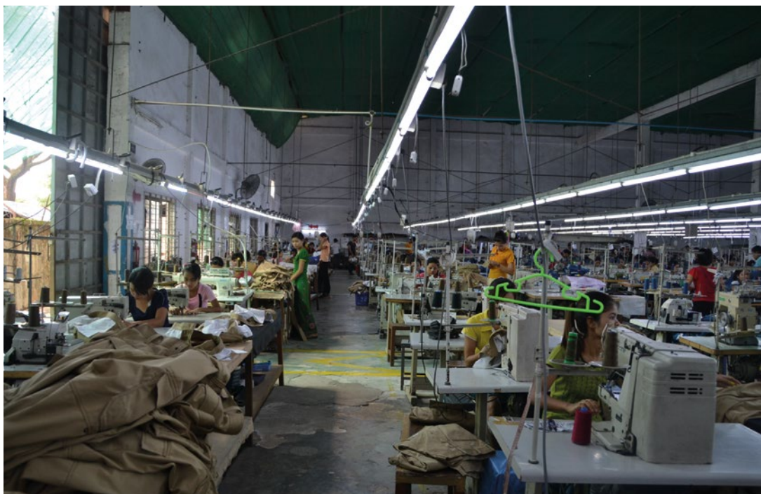
A garment factory in Myanmar (this factory was not included in the research).

Daily labourers were found to be among the workforce at four of the 12 investigated factories. Daily labourers do not sign contracts; they only receive the basic daily wage, which may be below the minimum wage of 3,600 kyat (€2.48) per day; they are not eligible for bonuses and benefits; and they are not covered by the social security system. In addition, daily labourers have very insecure jobs as in the absence of a formal employment relationship they are easily dismissed.