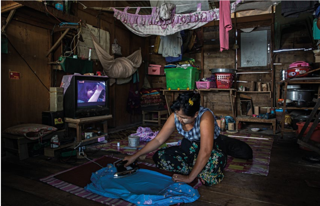
A woman irons clothes in her home.

Employers should, as a standard practice, conduct thorough age checks when hiring workers by checking their documents (NRC, township registration or birth certificate) and requiring a medical check. Young workers of 16-18 years old can only be employed with a valid CoF. Employers should be aware of unqualified medical bodies issuing forged certificates and NRCs. The employer should cover costs of CoF examinations. Buying companies, in turn, should be aware of their suppliers' administration and records being peppered with falsified documents.