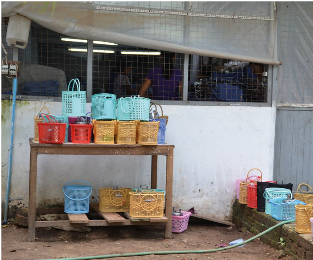
A garment factory in Myanmar (this factory was not included in the research).

At Factory 5, more than half of the interviewed workers were aware about trade union rights, as they had been in contact with ALR on different occasions. Some of the interviewed workers said they were interested in forming a trade union.