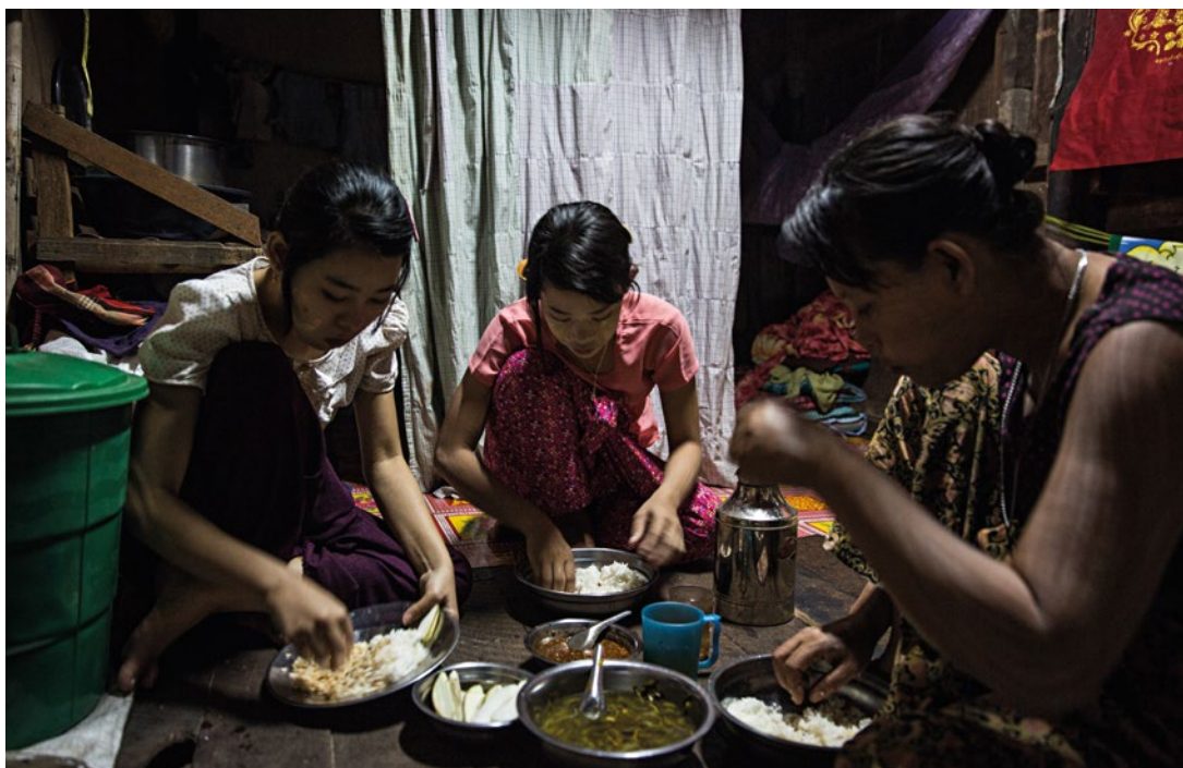
Garment factory workers eat dinner in their small home.