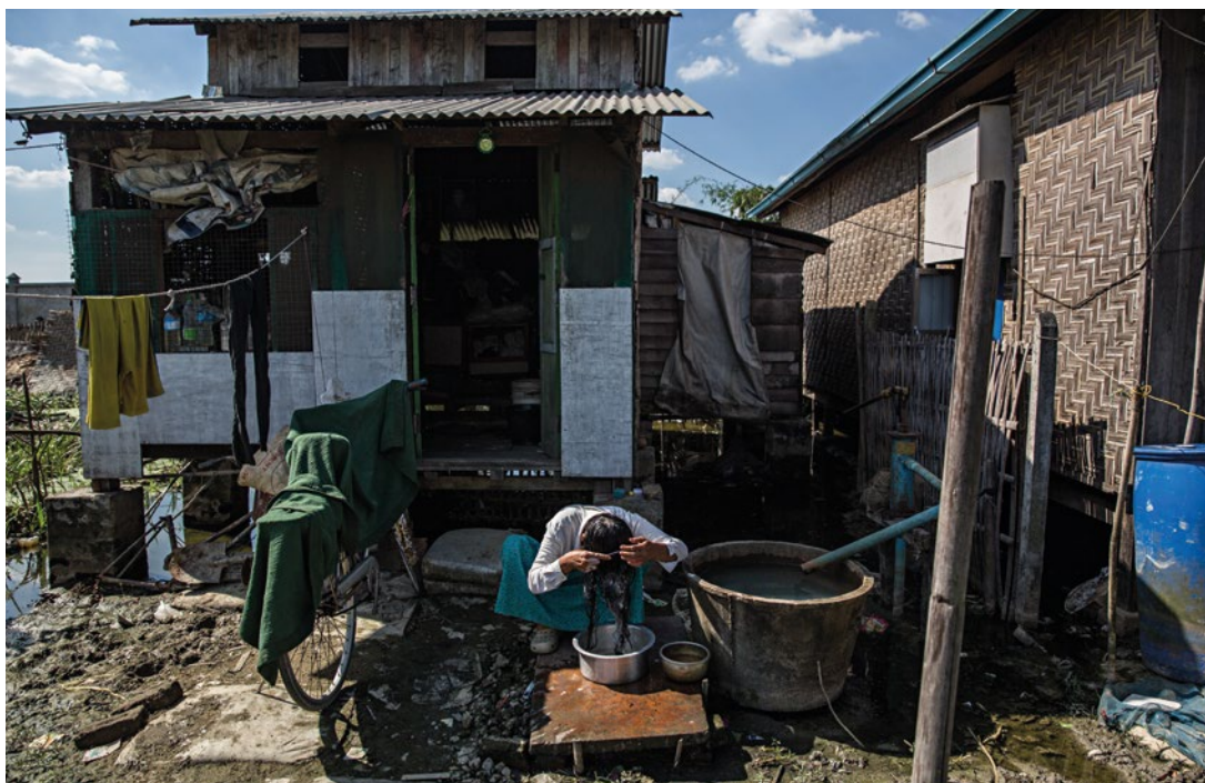
A woman washes her hair outside of her home in a squatter village where many garment factory workers live.