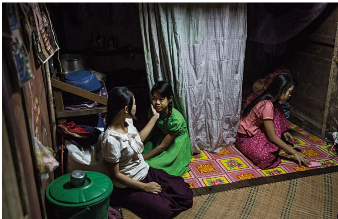
Garment factory workers sit in their home at the end of their work day.

The legal minimum wage applies across the country and across sectors and industries, but with the following exemptions: