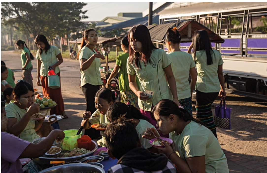
Garment workers eat breakfast at a small stand.