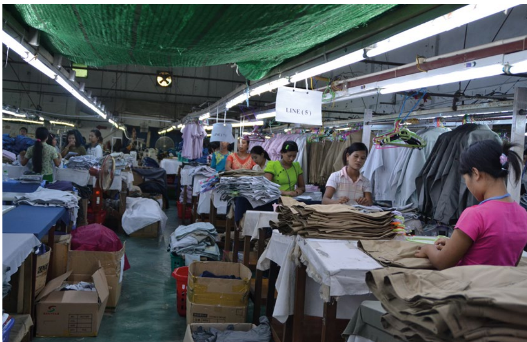
A garment factory in Myanmar (this factory was not included in the research).