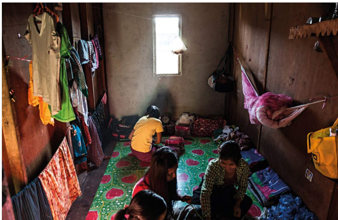
Garment factory workers prepare food in their small dormitory room in Yangon, Myanmar.