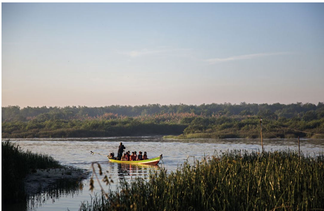
Garment factory workers travel by boat to work in the morning from a small village across the canal.

supplier list mentioned a number of factory names that no longer appear on the December 2016 version. According to C&A, one of the factories could not meet C&A's delivery deadlines. At two other factories, production was suspended due to poor audit results.