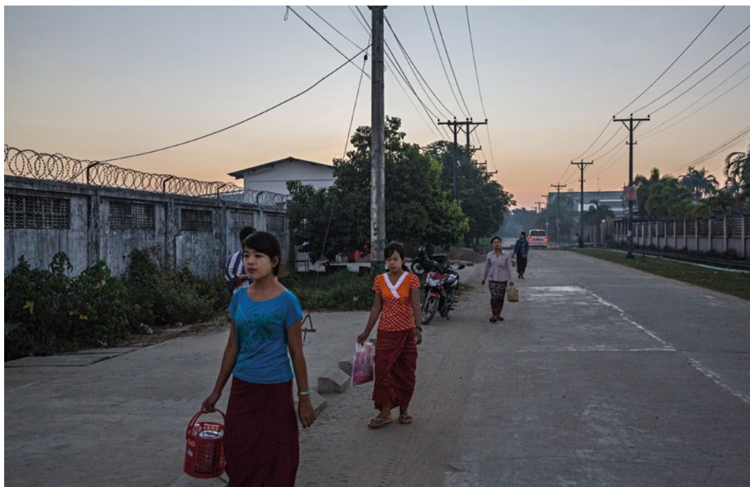
Garment factory workers walk to the factory in the early morning before work.

Reaction to factory findings: Deuter wrote to SOMO that it does not source from Factory 5 but from this unit. This unit and Factory 5 are part of the same company. The two factories are located at the same premises and fall under another unit of the same company. Both factories have been audited by FWF in May 2016. Deuter wrote that the results of the May 2016 FWF audit did not substantiate the working conditions as described by SOMO. Deuter wrote that the SOMO's findings regarding the employment of young workers were not confirmed by the audit. The youngest worker found during the audit was 18 years old. In its Social Report 2015 (reporting period July 2015-June 2016), Deuter summarised the results of the audit.