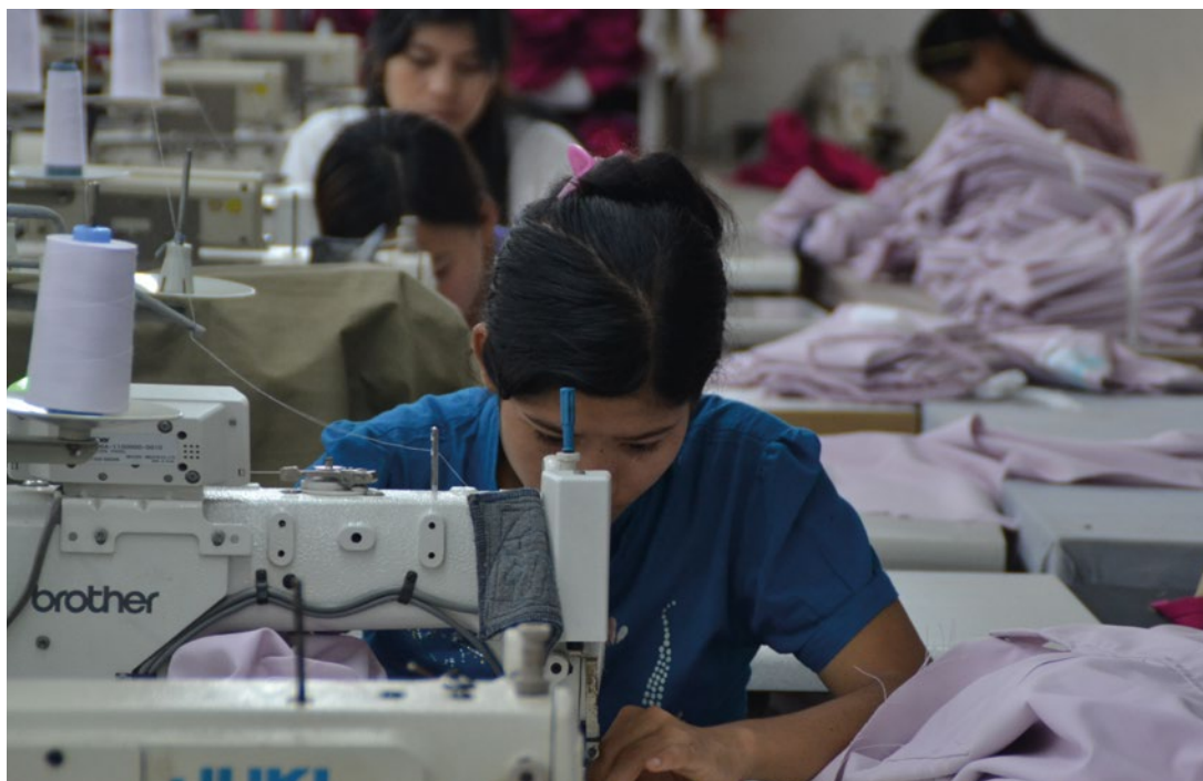
A garment factory in Myanmar (this factory was not included in the research).

They provide a mediation and conciliation platform for resolving practical issues that may arise with the implementation of the Guidelines. 88