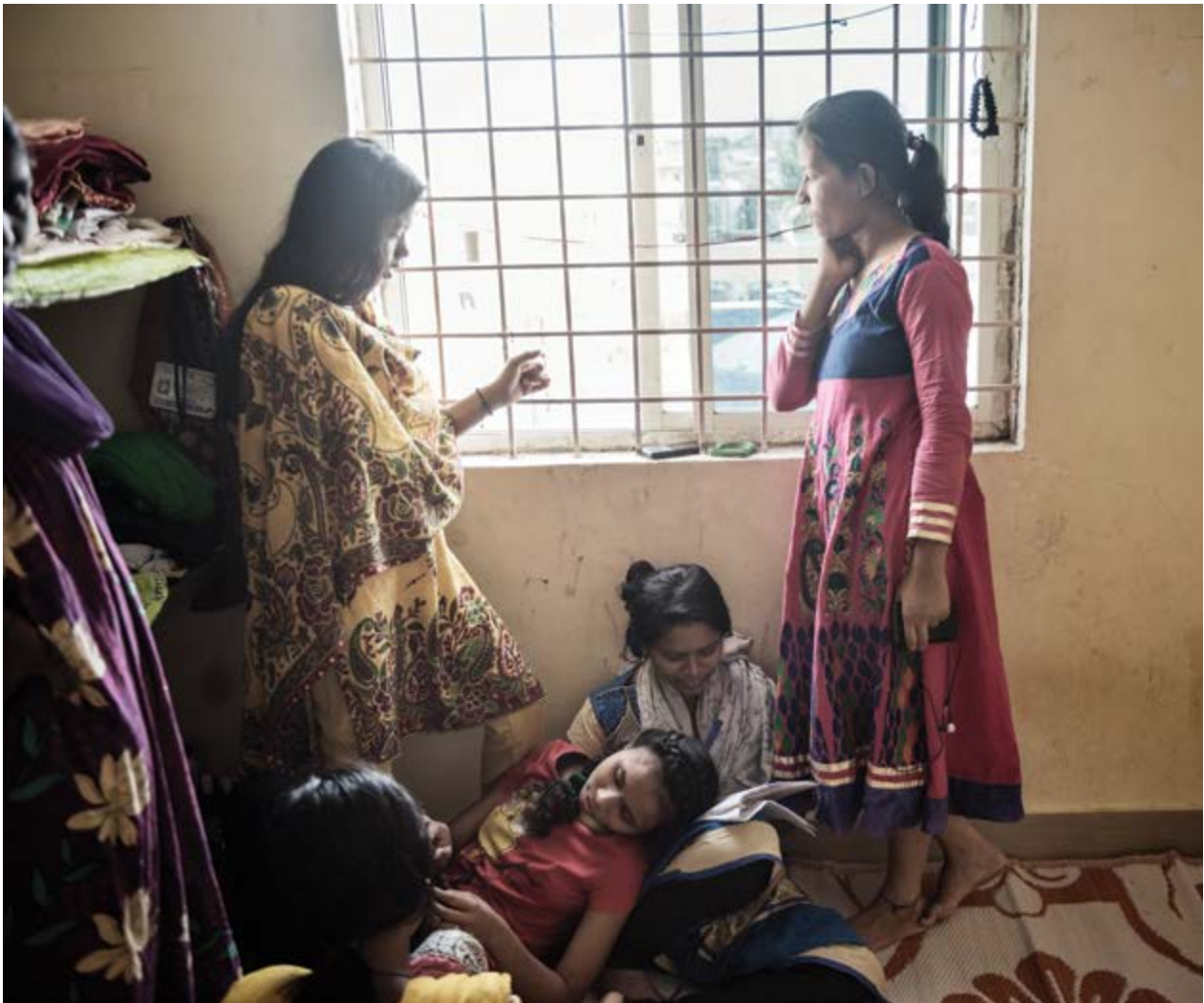
Factory girls' dorm, foto Andrea Bruce / NOOR