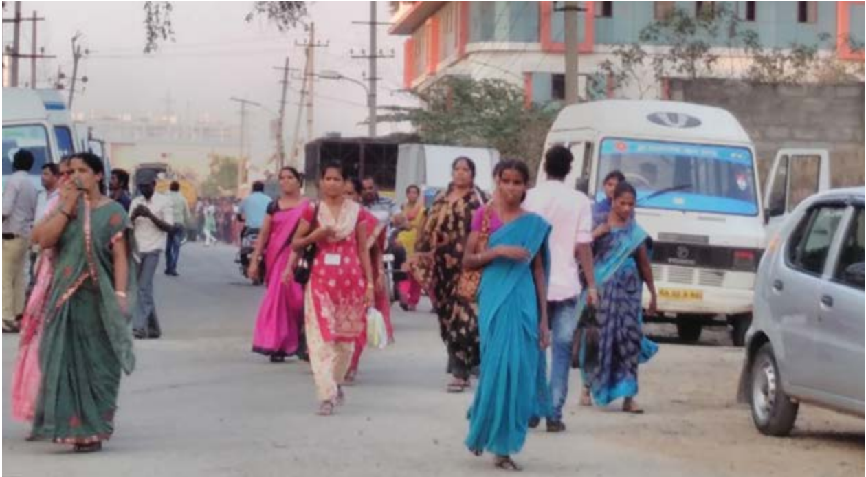
Garment workers are returning to their hostels at the end of the work day

The concluding chapter compares the research findings to indicators of forced labour as stipulated by the ILO. Furthermore, it compares the working conditions of migrants to that of local workers. Lastly, it assesses the responsibilities of the government of India and state governments and international brands and retailers.