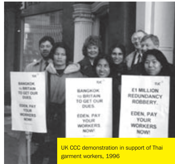
UK CCC demonstration in support of Thai garment workers, 1996

The CCC has limited resources and unfortunately is not able to follow-up on all the requests for action that are received. Decisions to take up cases are made by the CCC International Secretariat in conjunction with the urgent appeal coordinators at the various national-level CCCs (each CCC is a coalition of NGOs and trade unions, and each has a designated urgent appeal coordinator). These decisions are generally based on capacity available at that moment to undertake effective action. In prioritizing cases, national-level CCCs usually prefer to get involved in cases that have a connection to their coalition or market (ex. the German campaign is more likely to work on a case that involves a company that has its headquarters in Germany, or if based elsewhere sells its products in Germany). If the CCC is unable to take up a case, the campaign will, if possible, refer requests for assistance to other organizations that might be able to provide such support.