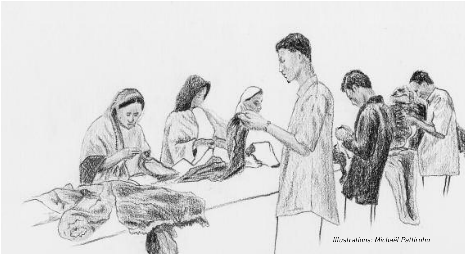
Illustrations: Michaël Pattiruhu

The trial in Turkey is not dealing with a wide range of elements normally found in a code of conduct. Instead it is focusing on certain key questions: freedom of association and the right to collective bargaining, wages, and hours of work. These elements were chosen after extensive consultation, and because they are the areas of most difference between the six partners.