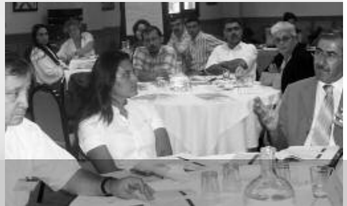
Representative of Turkey's Ministry of Labour contributing to a discussion at Jo-In's training seminar for Turkish NGOs and trade unions in Istanbul, July 2006.

Keeping everyone properly informed and consulted takes some care, time and effort, of course. All stakeholder organisations