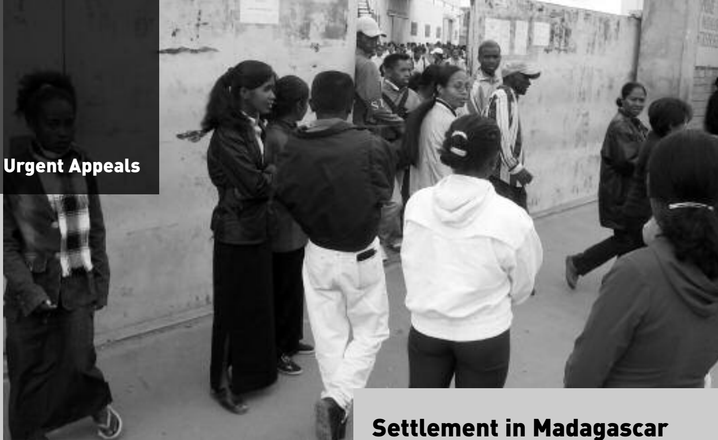
Garment workers in Madagascar, 2005

In September–October 2005, 255 A-One workers were unlawfully dismissed and forcefully removed from the site. They included workers' representatives who had been elected to form a Workers Representation and Welfare Committee under the 2004 laws governing EPZs in the country. A number of them received death threats. Nevertheless, the A-One workers tried to deal with their grievances through proper channels.