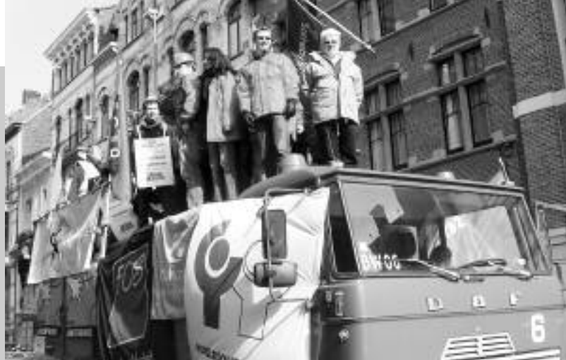
About 100 activists from a wide range of organisations protested April 11th in front of the Embassy of Bangladesh in Brussels, calling for improved health and safety in the Bangladesh garment industry.

The French CCC (Ethique sur l'Etiquette) is running a solidarity campaign that now involves 7,500 individual members and 190