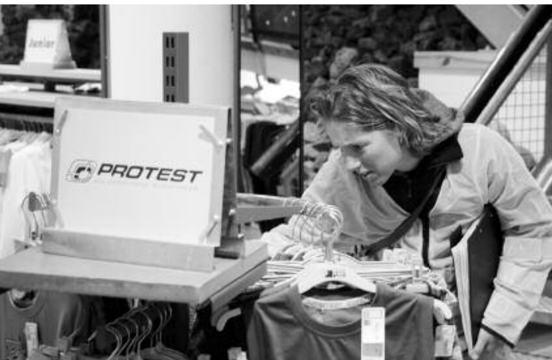
In central Amsterdam on April 11, 2006, Dutch CCC "safety inspectors" entered shops, looking for clothes from Bangladesh and questioning managers about the health and safety conditions of the workers who made them.

April 11, 2006 was the anniversary of the collapse of the Spectrum-Shahriyar factory in which 64 were killed, over 70 injured, and hundreds left jobless. To mark this day the CCC and partners participated in an International Action Day for Workers Health and Safety in Bangladesh to draw attention to the outstanding issues. In Bangladesh, there were demonstrations and a token hunger strike at the Central Shaheed Minar monument in Dhaka to demand "safe workplaces for the garment workers of Bangladesh". Over a thousand garment workers were joined by several of those seriously injured during the Spectrum disaster as well as family members of those who died. Around the world solidarity actions continued to put pressure on the Bangladesh government and the global garment industry to bring an end to these tragedies.