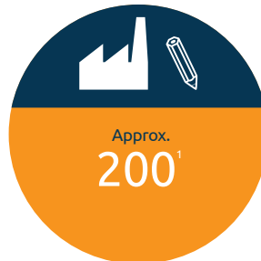
Registered garment factories (2013)