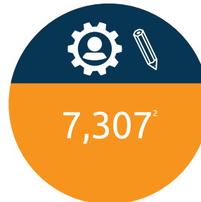
Registered employees in the garment industry (2010)