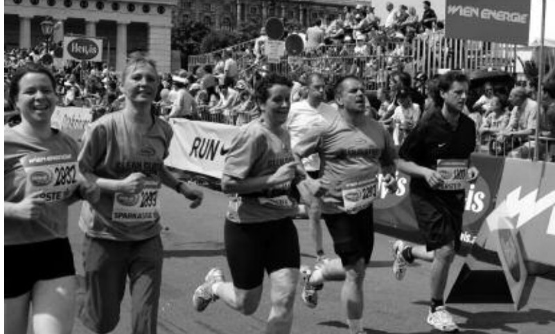
CCK supporters sweating for justice at the Vienna 2005 Marathon.