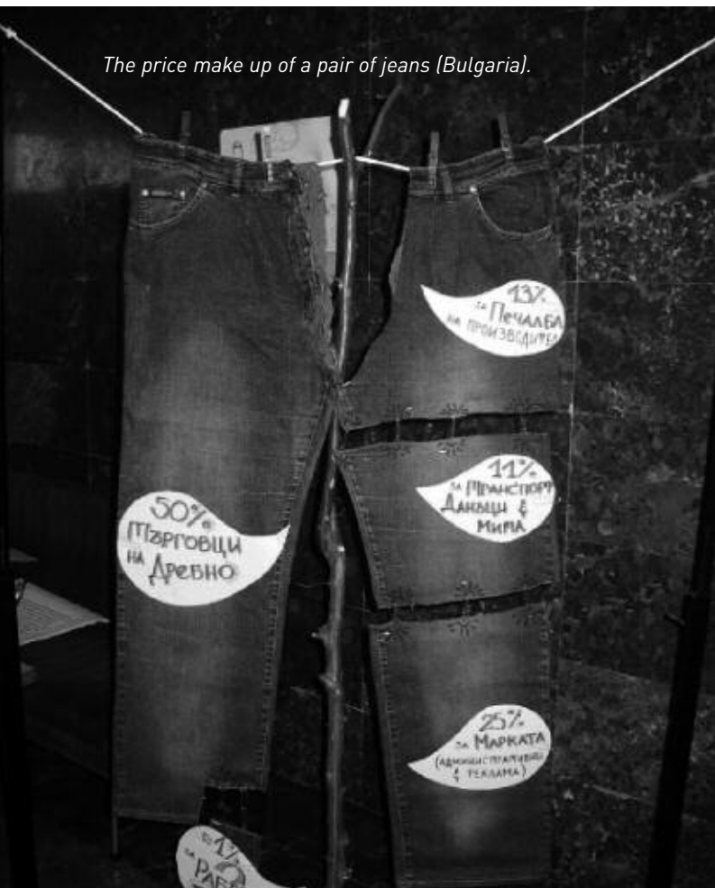
The price make up of a pair of jeans (Bulgaria).

For more on the garment industry in Bulgaria, Macedonia and Serbia, as well as Turkey, Poland, Romania and Moldova, please see "Workers' Voices – The Situation of Women in the Eastern European and Turkish Garment Industries" (details page 23). The exhibitions were based upon the research done for this report.