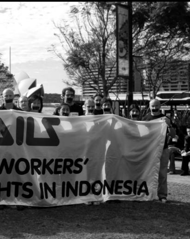
Australian activists protesting Fila's silence with regard to rights violations at their supplier PT Tae Hwa, Sydney July 2005.