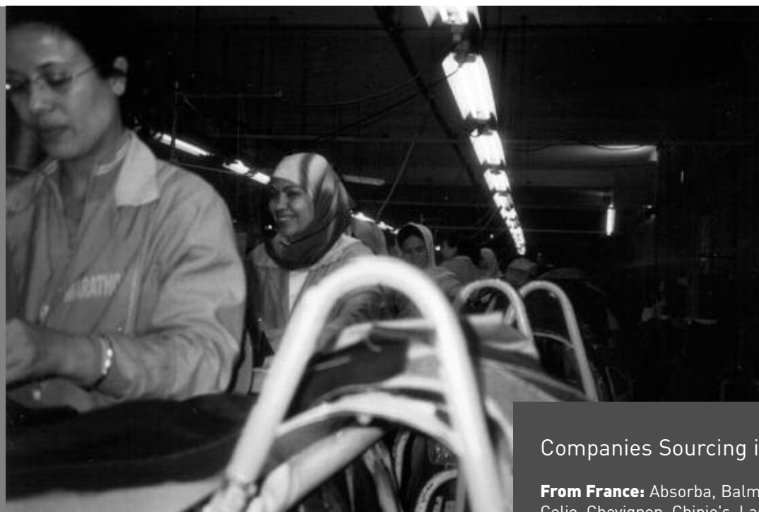
Workers in a jeans factory in Tunisia.