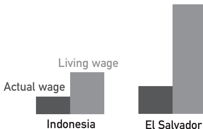
Figure 2: Actual and living wages in the sportswear industry

Sportswear campaigners have persistently highlighted the fact that workers producing sporting goods are overworked and underpaid. Recent research shows how this is the case for people working in El Salvador and Honduras to produce sportswear supplied to Adidas, and Nike. Their gross salaries (that is, before deductions) barely reach the legal minimum wage, even if they work seven days a week, and even this legal minimum is not enough to enable workers and their families to make ends meet. 9