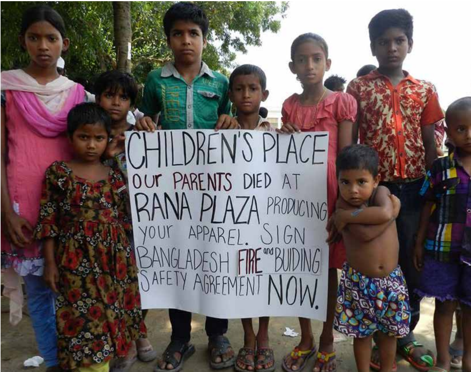
Orphans call on Children's Place to pay the compensation they owe and to sign onto the Safety Accord.

Bangladesh has long pursued the low road to industrialization, building a garment industry that has cut corners at every turn, underinvesting in infrastructure, worker safety and worker compensation. Global brands, which have continued to expand production, have helped fuel Bangladesh's low-road strategy. This strategy has secured Bangladesh its place as having the lowest paid garment workers in the world. It is also responsible for turning Bangladesh into the most dangerous place to be a garment worker.