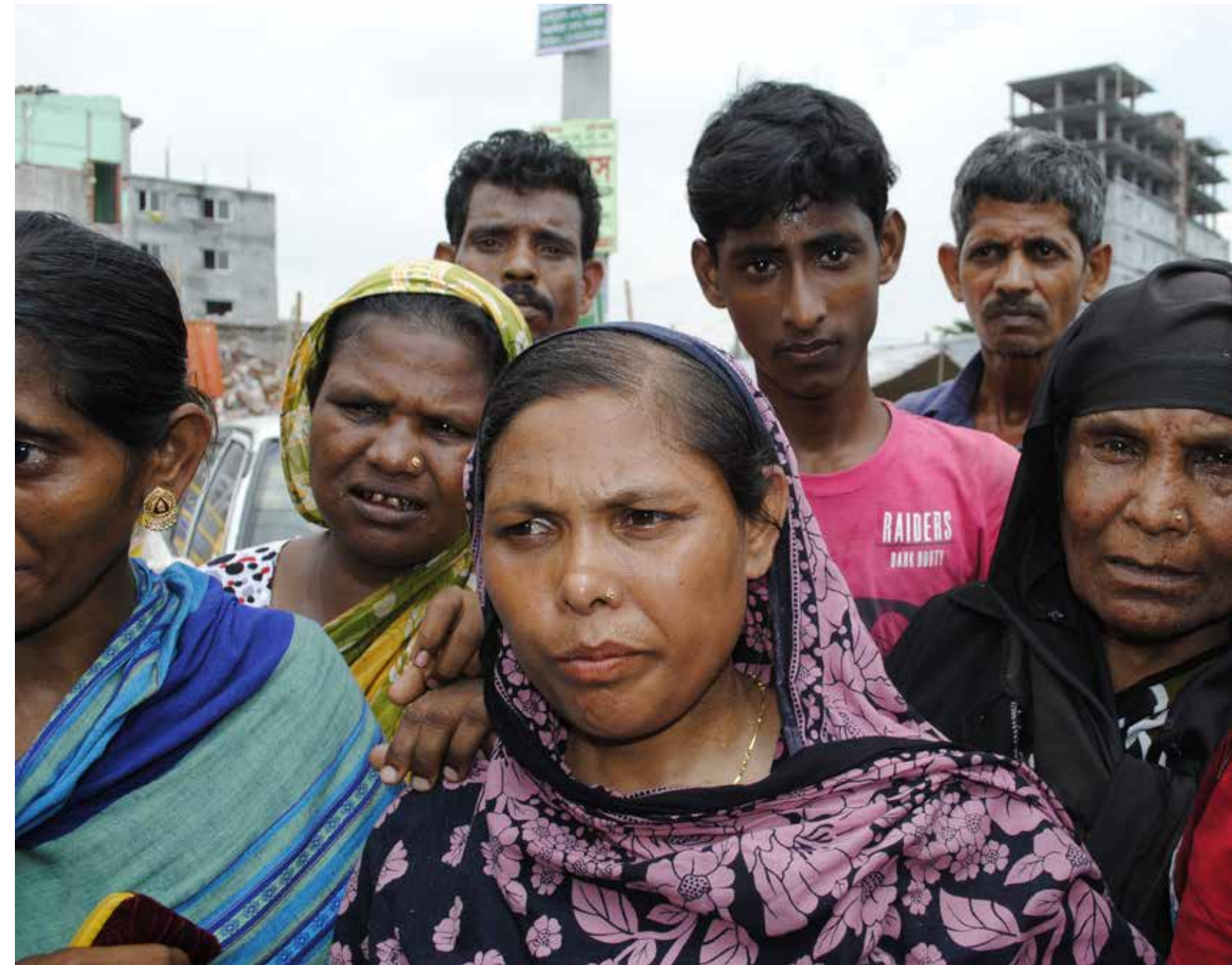
Affected family members.